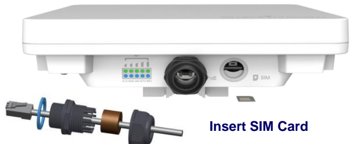
Insert SIM Card