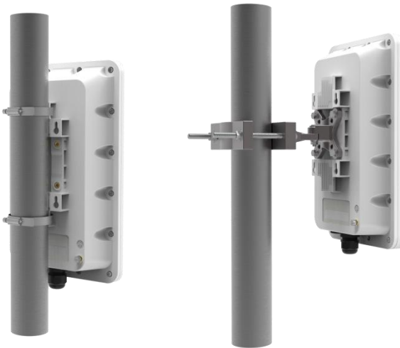
Installing ODU – Clamp